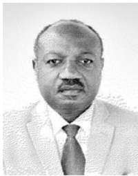
Dr. Basden J. C. Onwubere

The Nigerian Hypertension Society (NHS) was inaugurated on April 27, 1993. It was founded out of the great need to provide knowledge of the prevalence, causes, prevention and treatment of hypertension and its complications.