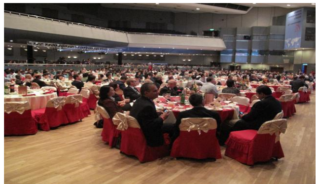
Faculty Dinner at Crown Plaza Park View Wuzhou Beijing