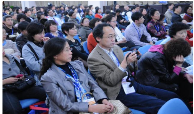
WHC 2009 Participants

During the next three days the congress featured 38 academic symposiums, seven oral presentation sessions, 10 morning courses, and one workshop. Over 400 posters were presented covering at least 30 topics. These ranged from experimental research to overweight and obesity, diabetes and the metabolic syndrome, blood pressure measurement and imaging procedures. More than 40 international societies supported this meeting.